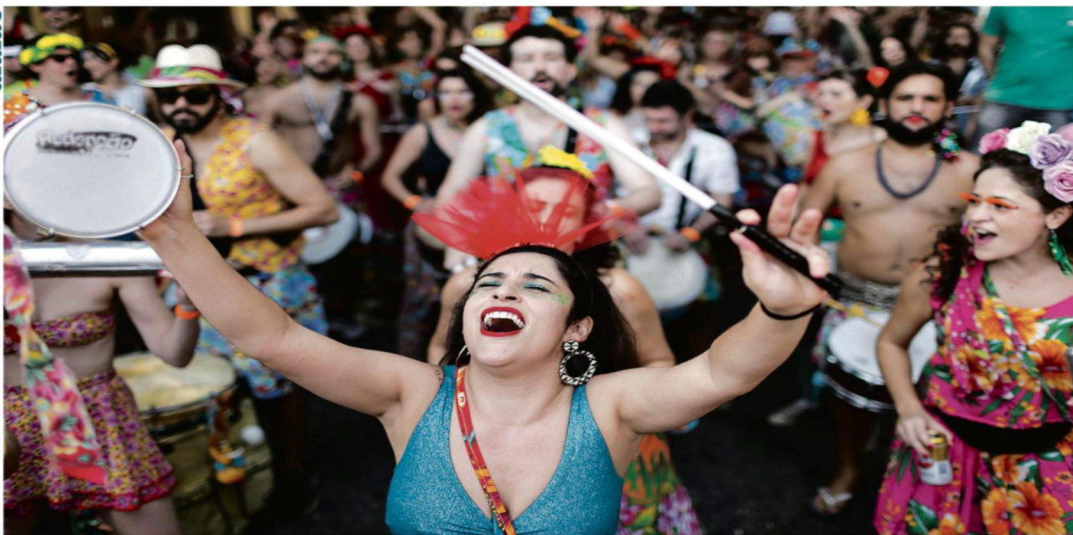
Foliá do bloco Saia de Chita, da zona oeste de SP, em um dos quatro cortejos que saíram às ruas da capital paulista nesta quinta-feira (21), em meio ao medo de repressão