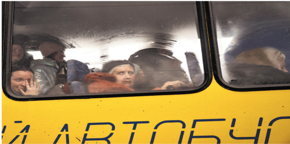
Passengers arrived in Zaporizhzhia, Ukraine, on Thursday after fleeing Mariupol and riding all night through Russian-held territory.