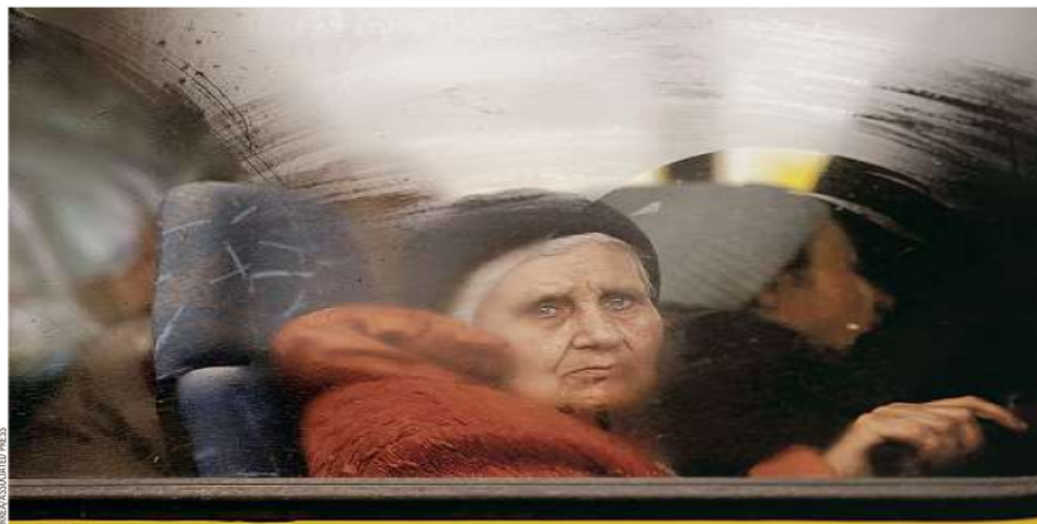
A woman from Mariupol arrived Thursday at a refugee center in Zaporizhzhia, Ukraine, as residents fled the Russian attack.