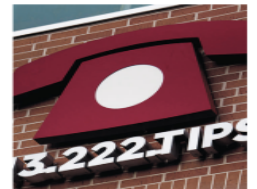
CALLAGHAN OTTAWA FOR THE NEW YORK TIMES Crime Stoppers of Houston has become reliant on state grants.

The group's aggressive posture on the issue followed shifts in Houston's approach to prosecuting low-level crimes and setting bail. The changes helped prompt a political backlash fed in part by the Crime Stoppers campaign and a rising murder rate.