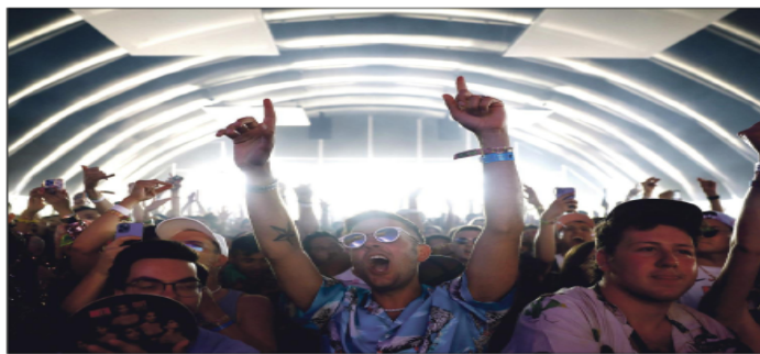
FANS ENJOY a show at the Coachella festival in Indio on Sunday. Short-term rentals in nearby Palm Springs face stiff fines for loud music or too many cars.