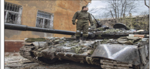
A RUSSIAN soldier stands atop a damaged tank Monday in Ukraine's coastal city of Mariupol.

"We finally found where [See Ukraine, A4]