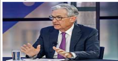
Fed Chairman Jerome Powell indicated the central bank was likely to raise interest rates by a half percentage point at its meeting next month, sending stocks lower. A2 and B1