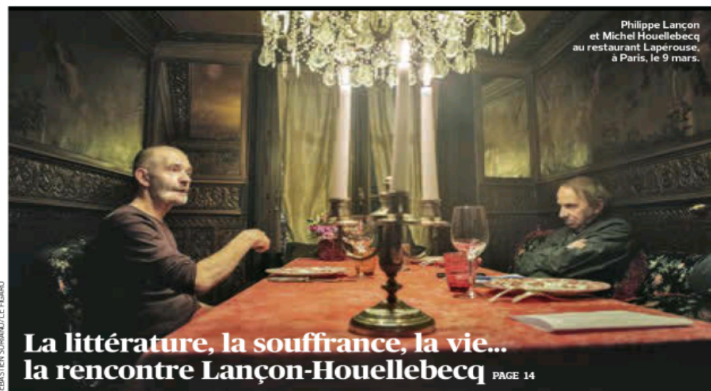
Philippe Lançon et Michel Houellebecq au restaurant Laperouse, à Paris, le 9 mars.

→ 30 MILLIARDS D'EUROS D'AIDES PUBLIQUES POUR LES ENTREPRISES ET LES MÉNAGES → PRÉSIDENTIELLE: LE POUVOIR D'ACHAT, THÈME MOBILISATEUR DE LA CAMPAGNE → LES CANDIDATS RIVALISENT DE PROPOSITIONS POUR LE PORTEFEUILLE PAGES 2, 3 ET L'EDITORIAL