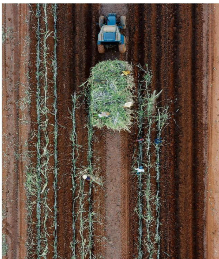
Trabalhadores realizam o plantio de cana-de-açúcar no interior de São Paulo.