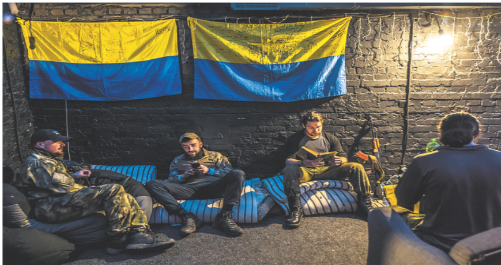
Ukrainian soldiers in Kyiv after fighting on the front lines north of the capital Monday. Shelling continued in Irpin, a Kyiv suburb.