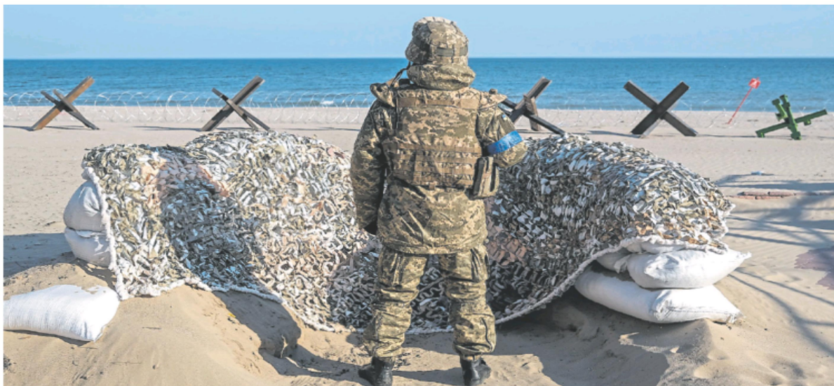
Las fuerzas ucranianas desplegaron en las playas de Odesa defensas para evitar el desembarco de tropas rusas

El salto de los precios internacionales del petróleo y el gas puso en alerta al sector energético. En el interior, ya se aplican cupos a la venta de gasoil y hay faltantes de GNC en las provincias del norte, que podrían extenderse. También se espera que el desabastecimiento alcance a las garrafas, mientras la industria anticipa cortes de gas para el invierno. Página 17