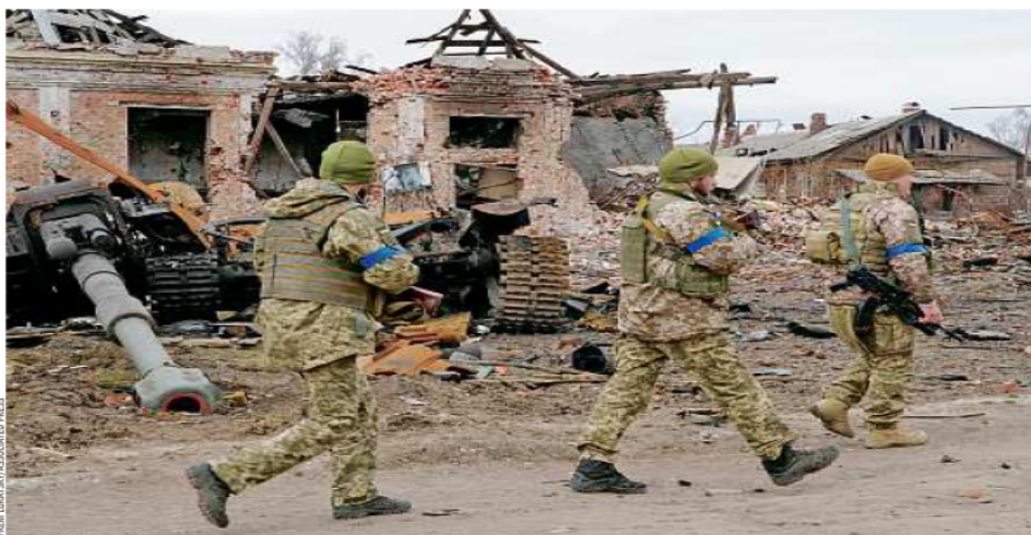
Ukrainian troops pass by damage on Monday in the town of Trostyanets, in the northeast near the Russian border.

© 2022 Dow Jones & Company, Inc. All Rights Reserved