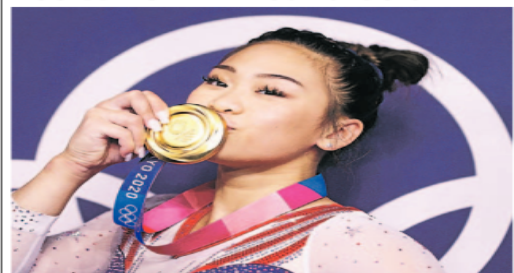
American gymnast Sunisa Lee became the new Olympic women's all-around champion on Thursday. A11