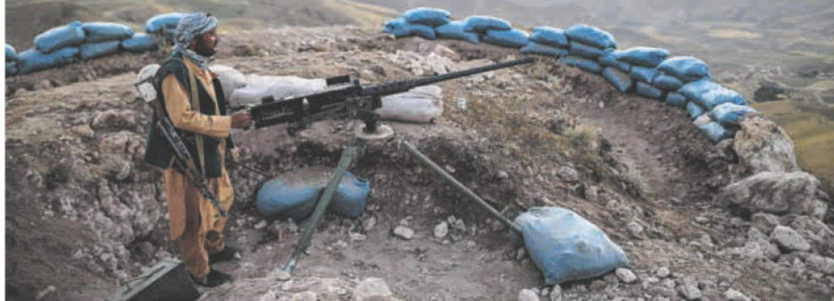
ILLUSTRATION FABIEN CLAIREFOND - LARA BALAIS/AFP - ILLUSTRATION BAUMGARTEN VIA GETTY IMAGES

Alors que les talibans progressent irrémédiablement dans la reconquête du pays, Russes et Turcs se positionnent déjà pour tirer profit du départ des Américains. PAGES 2 À 4 ET L'ÉDITORIAL