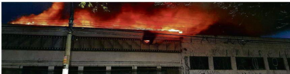
Fogo consome instalações da Cinemateca Nacional na Vila Leopoldina, zona oeste de São Paulo Arthur Sens

Presidente erra sobre apurações em 2014 e 2018; veja checagem A6