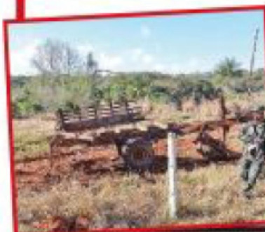
Destrozo. El camión en que iban los uniformados muertos quedó hecho chatarra.

Asesinan en un ataque en el Norte a tres militares de la Fuerza de Tarea