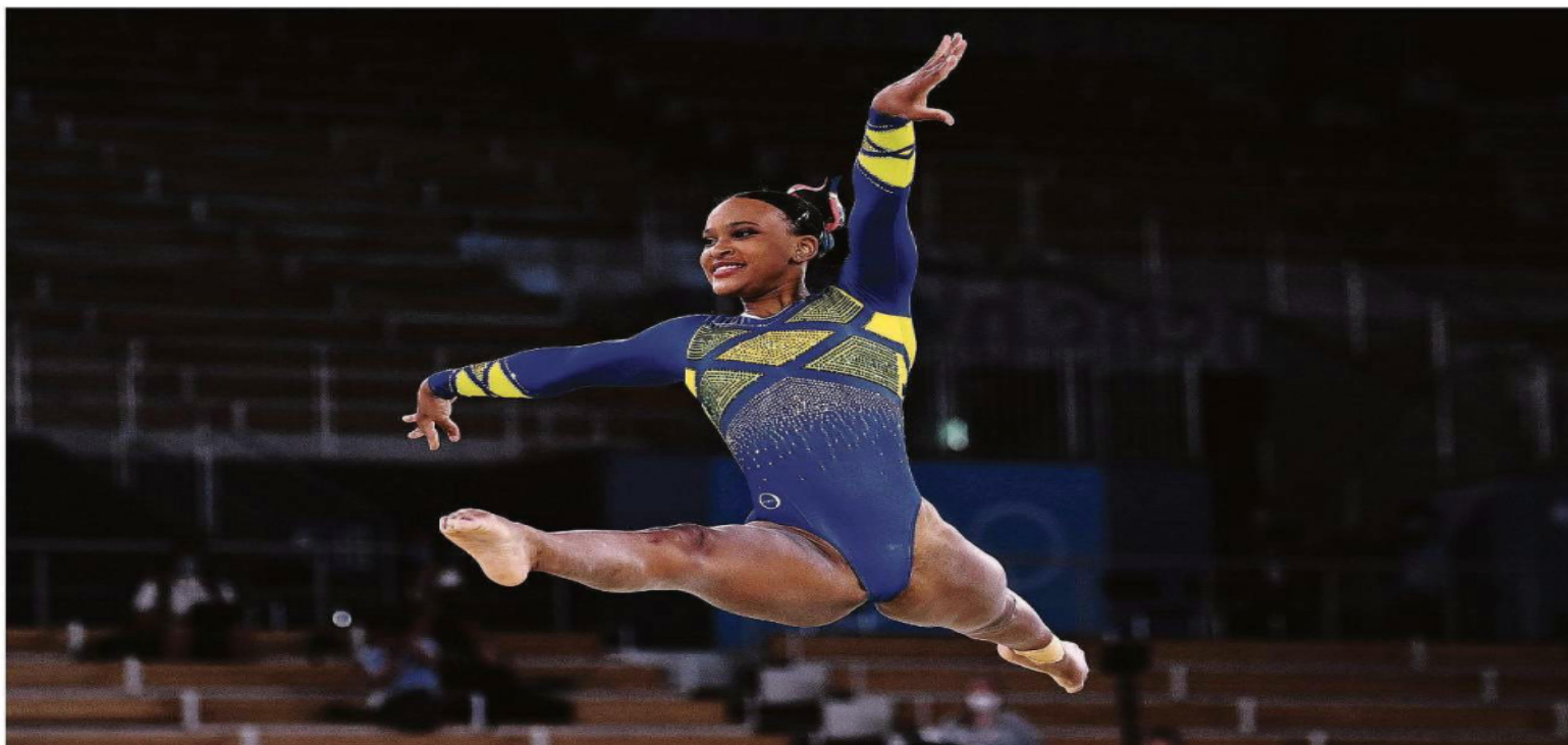
A ginasta Rebeca Andrade se exhibe na final individual feminina nos Jogos de Tóquio, no ginásio Ariake; brasileira levou prata inédita, 0,135 ponto atrás da americana Sunisa Lee