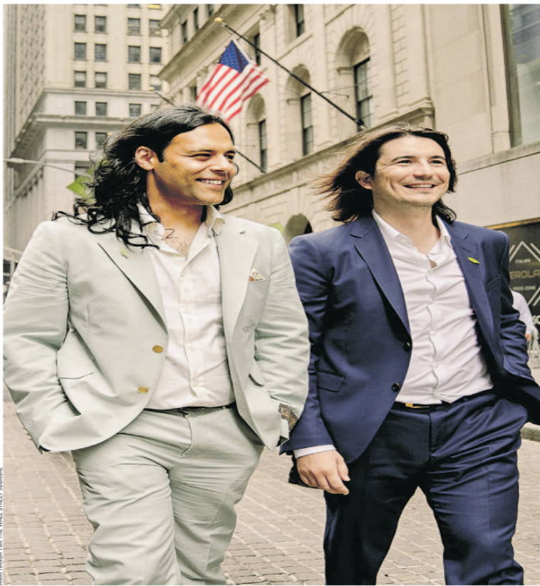
NEW DAY: Robinhood founders Baiju Bhatt and Vladimir Tenev on Wall Street on Thursday as the app synonymous with meme stocks made its trading debut, closing down 8.4%. B1